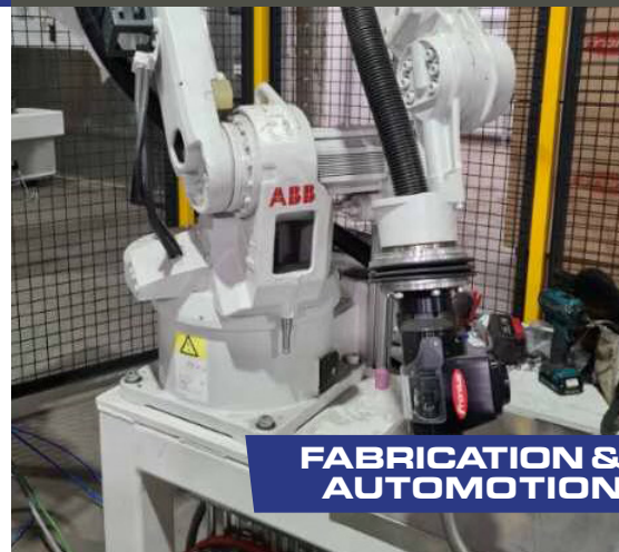
FABRICATION & AUTOMATION